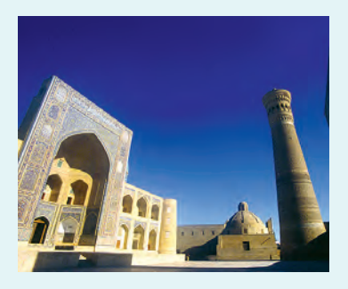
Few landmarks have tantalised the minds of travellers more than the legendary cities of Central Asia.