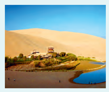
The Silk Road was not simply a highway for the trade of precious items; it was also the main East West artery for the flow of ideas.